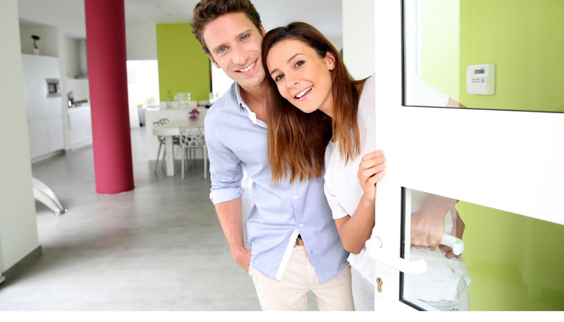
7 Steps to Home Buying Success